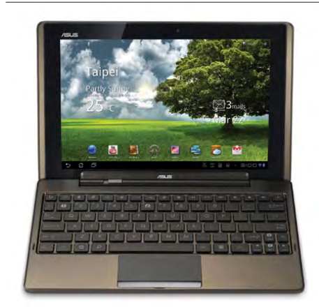
With the optional keyboard/dock accessory Asus offers, the Eee Pad Transformer essentially becomes a very portable notebook.

embedded hardware security, construction suited for field use, and a 1,024 x 768 XGA (Extended Graphics Array) screen made for outdoor daylight viewing