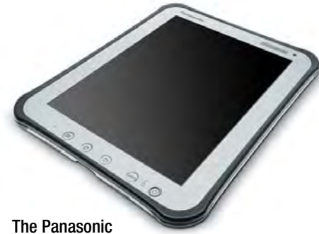
Toughbook includes construction features meant to withstand use in the field.

iOS and Android are the primary choices currently. The iPad is a logical choice for previous owners of iPhone and iPod devices due to familiarity and functionality reasons. Android is a solid option for those who already rely heavily on Google services due to Google involvement in developing Android. One note about Android is that because it's an open-source platform, manufacturers can tweak their