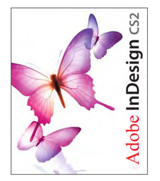
Adobe InDesign CS2 is used to publish PCC News

Contents © 2012 PC Community, except as noted. Permission for reproduction in whole or in part is granted to other computer user groups for internal, non-profit use, provided credit is given to PC Community and to the authors of the material.