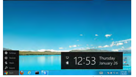
... or your plain ol' regular desktop.

enable the wireless card during Setup, so Action Center complained that I was not logged in when the desktop arrived.