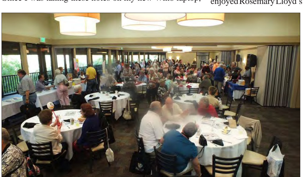
The ever popular dining center

local folks actually still going into the shop and meeting