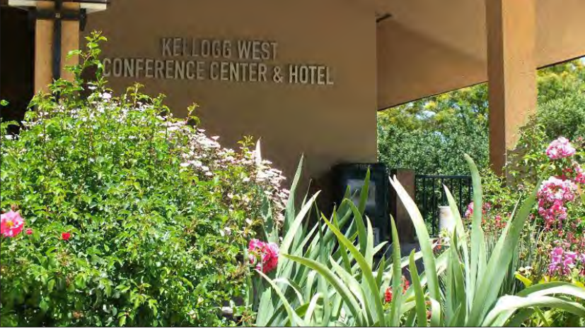
New convention hall for SWCC

optional field trip, followed by special group sessions starting Friday afternoon, a keynote and dinner the evening; Saturday workshops and an evening vendor expo, Sunday morning