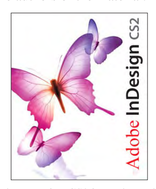
Adobe InDesign CS2 is used to publish PCC News

Contents © 2013 PC Community, except as noted. Permission for reproduction in whole or in part is granted to other computer user groups for internal, non-profit use, provided credit is given to PC Community and to the authors of the material.