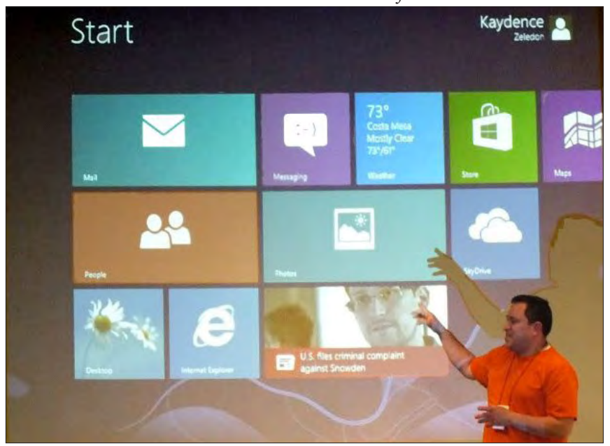
Windows 8 requires lots of explanation

Another facet of the gem was the location itself. Since I fly to either San Diego or Ontario, the airport routine is pretty similar. However, the Kellogg West Conference Center and Hotel at Cal Poly Pomona has a free shuttle service that got arranged when I made my reservation. The Kellogg Center is the practicum for the Hospitality Management program. Except for the supervisor, everyone seemed to be a student competing to be helpful and pleasant. The one person I identified as a supervisor was doing his best to demonstrate good hotelier skills. The only complaint I had about the food at the new site was the constant temptation to overeat. Oh, well. It's only for a weekend and it's for a good cause.