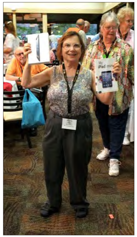
PCC Personage wins iPad Mini!

I'm already looking forward to next year's Southwest Computer Conference. It has developed the tradition of meeting for Fun in the Sun and Computers Too toward the end of June. If you're tempted, keep an eye on theswcc.org. Wondering if you're enough of a computer user groupie to come? f you've read this far you definitely are.