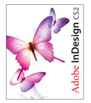
Adobe InDesign CS2 is used to publish PCC News

Contents © 2012 PC Community, except as noted. Permission for reproduction in whole or in part is granted to other computer user groups for internal, non-profit use, provided credit is given to PC Community and to the authors of the material.